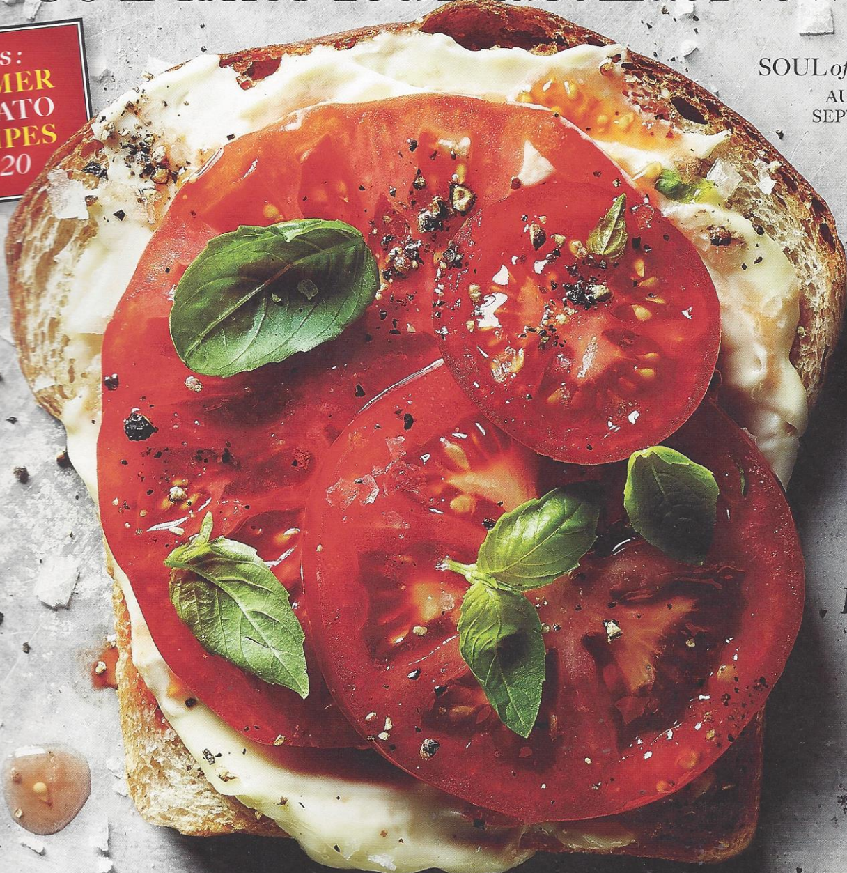
THE RIPE STUFF A tomato-and-mayo sandwich with basil

The True Story Behind the Filming of Deliverance p. 112